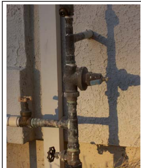
The PRV requires annual maintenance by the homeowner to ensure it is working properly.

As a reminder, in case of an emergency, know where the main